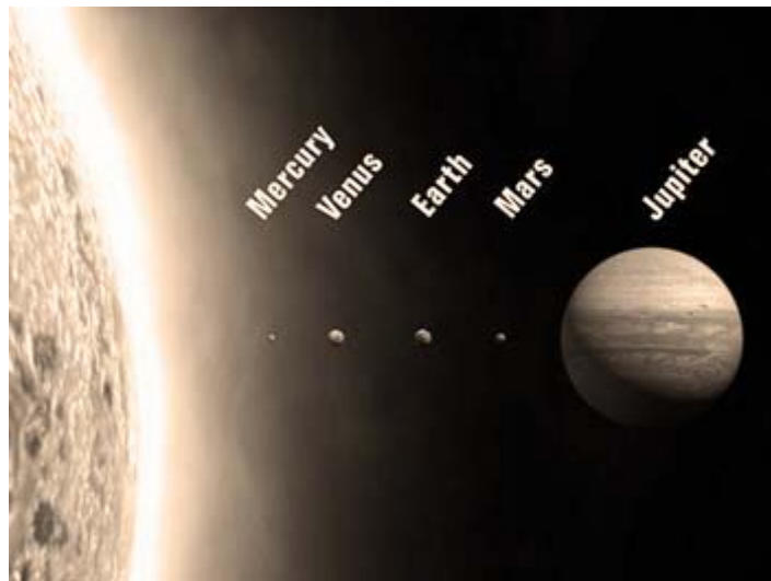
The sun is 1.3 million times larger than the earth. When its temperature changes, our temperature changes.

Well, here's the breaking news. And you must pay close attention . . . because what I'm about to tell you has been deemed a "forbidden theme" in the scientific community.