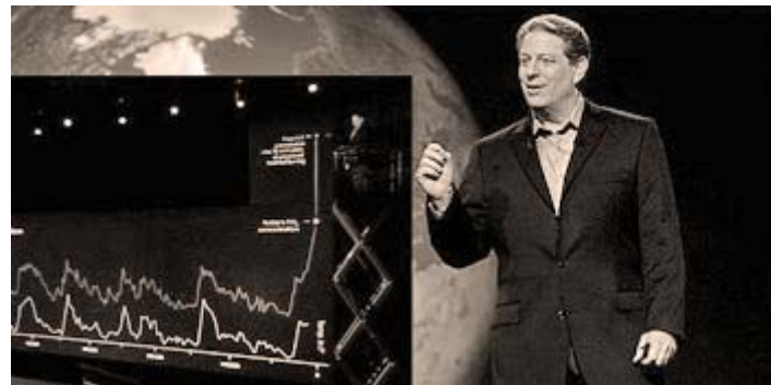
Al Gore spreads “Global Warming” propaganda for his own profit.