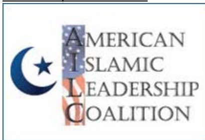
American Islamic Leadership Coalition