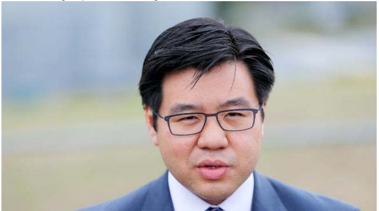
Federal Race Discrimination Commissioner Dr Tim Soutphommasane.