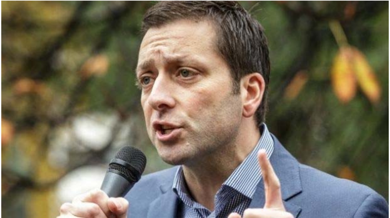
Matthew Guy is leading Daniel Andrews 51 to 49 per cent as preferred premier.