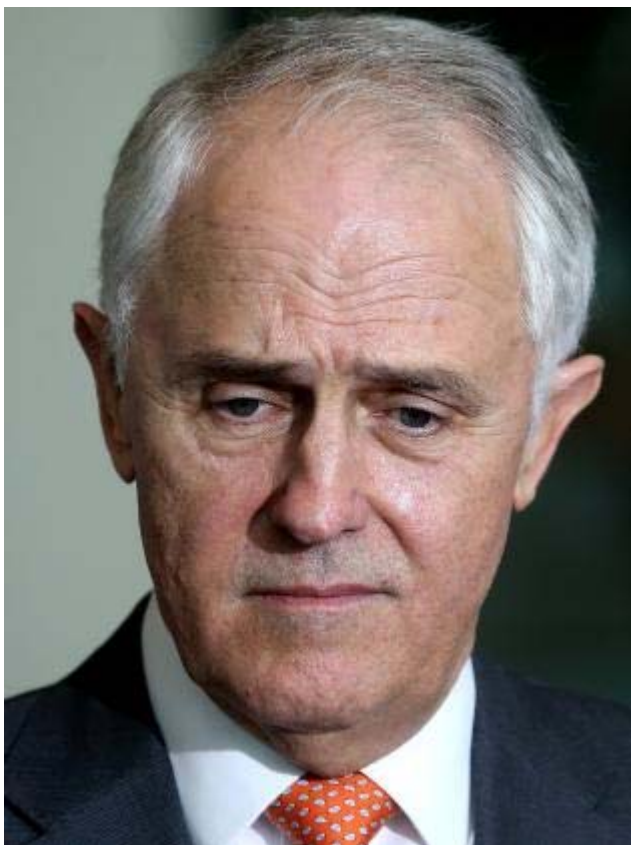
While Turnbull is there, there's no point to the Liberal Party.

Yet he's now flogging a Finkel report that says the Liberals' own 2030 target should jump from 26 per cent to 42.